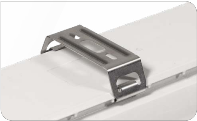
BRACKET 3G INOX 316